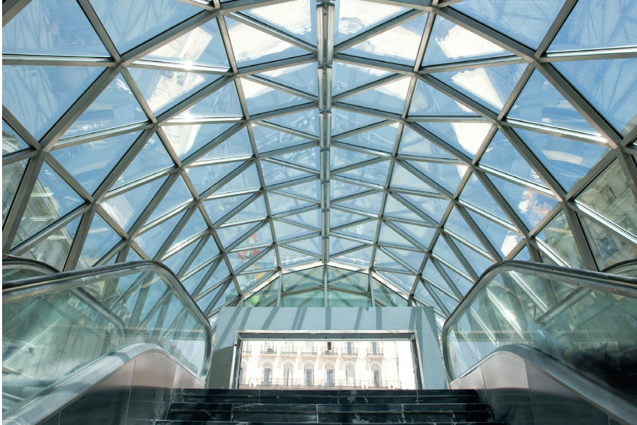
Entrance to Sol local train station

It has received the 2009 Best Public Works Award for Madrid from the Civil Engineers Association