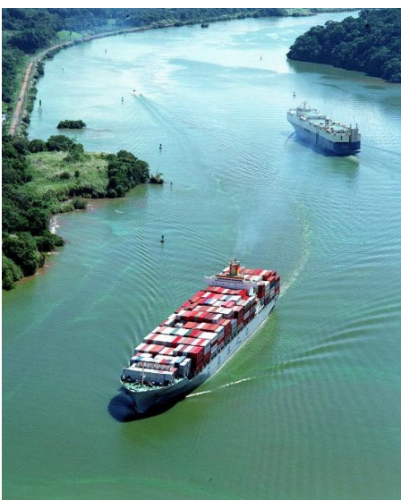
View of the canal as it is today

The Panama Canal Authority (ACP) has awarded the contract for the construction of its Pacific access channel to a joint venture partnering FCC Construc-