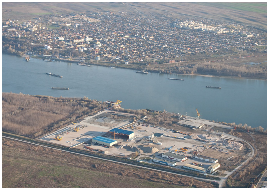
Aerial view of the casting facility