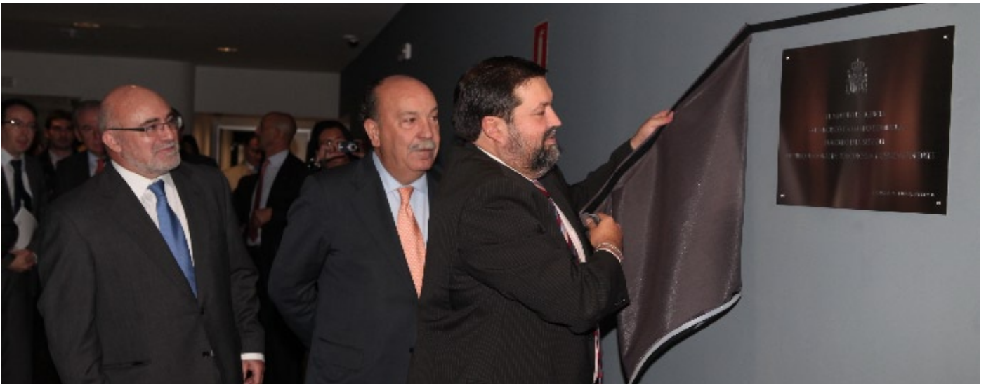
Institute opening by Minister of Justice Francisco Caamaño

The new building is situated in Las Rozas and has over 16,000 square metres of floor space