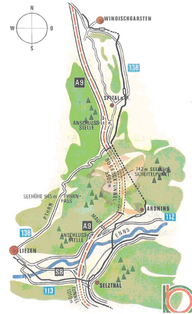
Bosruck tunnel layout

The enlargement of this infrastructure will provide a two-lane connection between the Austrian states of Styria and Upper Austria. The Bosruck Tunnel is currently a bottleneck on the A9 expressway.