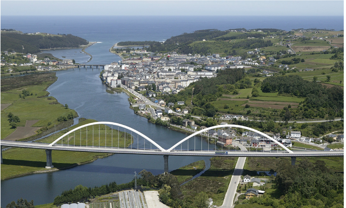
Viaduct over the Navia River

The project built by FCC forms part of the Navia relief road