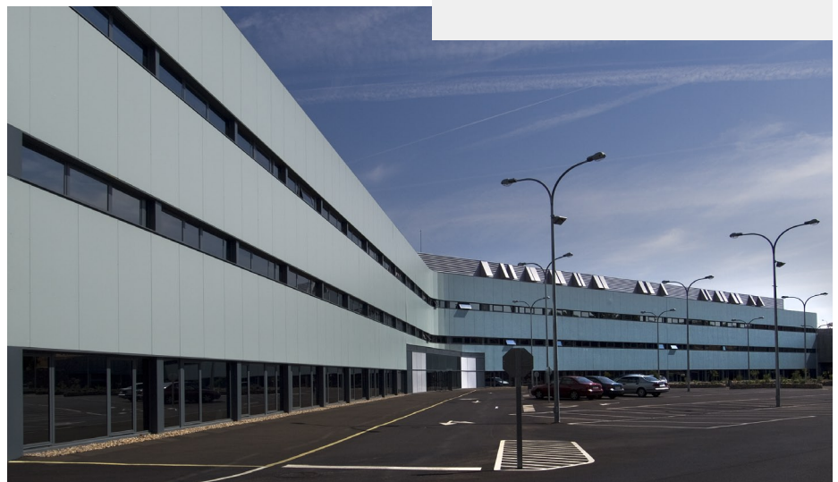
Façade of the new building