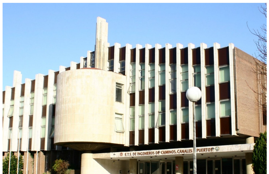
Site of the post-graduate studies

Public Works and Housing, four professional associations and more than sixty other entities have collaborated in the courses offered and the sharing of experiences, along with professors from seven Spanish universities.