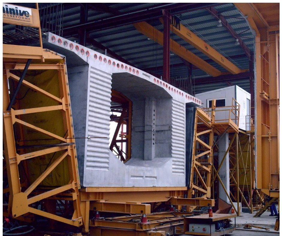
Casting a test segment in the casting facility

Made of eight piers whose height varies between three and 20 metres, this bridge has got seven 80-metre spans and one 52-metre-long span. The standard cross-section of the deck in this area is the same as in the bridge over the na-