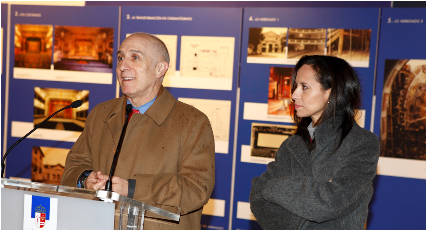
Housing Minister Beatriz Corredor, accompanied by Jesús Dionisio Ballesteros, mayor of Aranjuez

The minister conducted an on-site works progress check